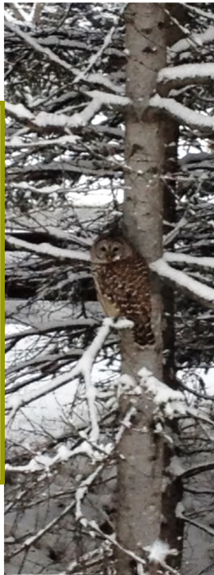
Bard Owl at Dewey Building