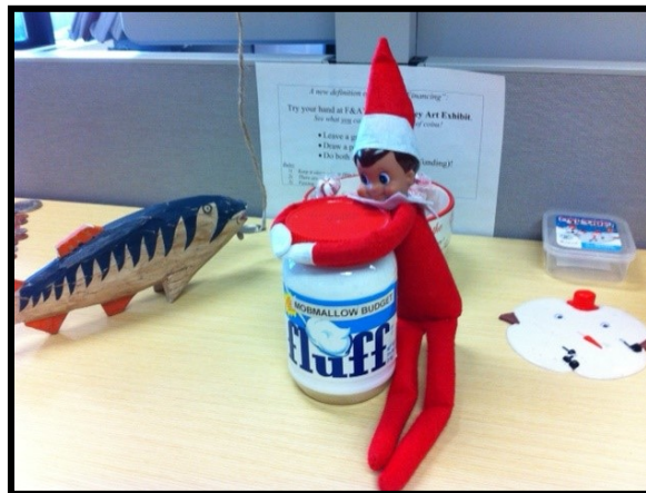
"Moblallow Budget Fluff"