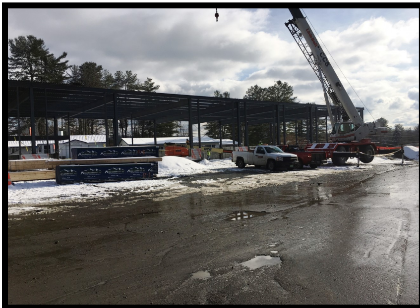
Photos of the new District 4 White River 10-bay Maintenance Facility. This project is currently under construction and is due for completion in the spring.

This building will house the Operations staff and the current garage, which had a 2-bay addition last year, will become the Regional Mechanics Facility. The project began this fall with the installation of a new 8" waterline back to the main road, and is having the wall infills and roof put on. The work will continue inside throughout the winter. The total project cost is approximately $2 million.