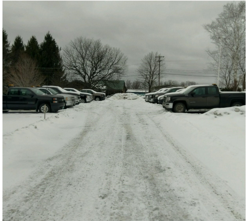
Our "temporary" parking which will be permanent and eventually come around the other side of the Dill building. For now we have gained 20 spaces.