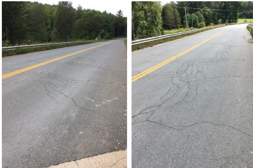
Figure 5: Pavement deterioration. Photo on left shows the pavement deterioration approaching the north end of the bridge, while the photo on the right shows the pavement deterioration approaching the south end of the bridge.

Significant cracking was evident around the bridge joints, Figure 4 and the approaches to the bridge, Figure 5. The cracking around the bridge joints were also noticed during the prior year's inspection by the Research Section and by the Bridge Management and Inspection Unit. Observations from the field show that the approaches to the bridge, from the north and the south, are experiencing significant transverse and longitudinal cracking. In certain areas, which are evident in Figure 5, alligator cracking has begun occurring. The patching near the bridge joints that was noticed during last year's research inspection seems to be performing well, accomplishing the task of extending the life of the bridge joint. At this point it is unclear why this cracking is occurring, but it is most likely attributed to the deterioration of the concrete bridge joint underneath the Flexogrid Membrane. Further discussions with the Structures Unit and The Bridge Management and Inspection Unit would have to be had to accurately determine the cause of the deterioration around the bridge joints and the approaches.