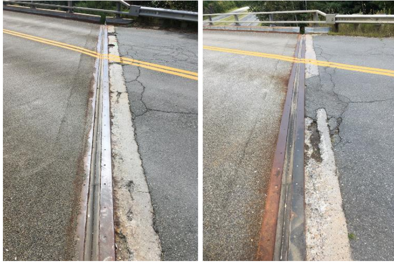
Figure 4: Bridge joints. Photo on left shows the bridge joint on the north end of the bridge, while the photo on the right shows the bridge joint on the south end of the bridge.