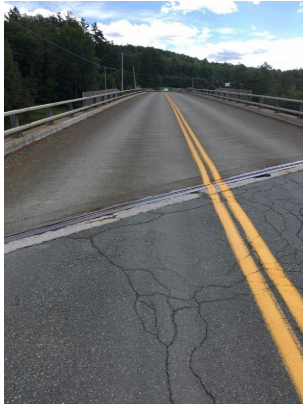
Figure 2: Overall View of Bridge 8 on Concord Ave. (TH 4), Waterford VT. Facing south over I-93.