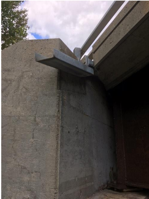
Figure 8: Bridge 8 abutment and extended gutter.

No new cracking to the bridge abutments was found near the bridge joints. This is most likely attributed to the extended gutter, seen in Figure 8, which carries run-off from the bridge joints away from the abutments.