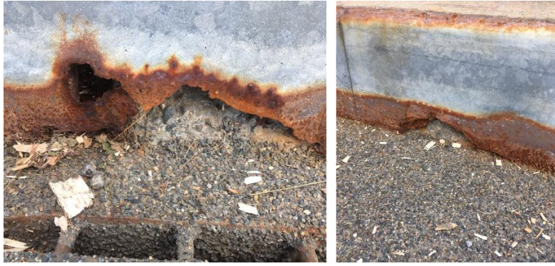
Figure 6: Deterioration of metal curb protector.

Figure 6 shows the deterioration on the metal protection of the curb. Aggressive agents from run-off and winter maintenance has most likely attributed to the metal curb protector deterioration around the concrete curb. The extent of deterioration and corrosion seems minor and has been slow to progress. The rust and some of the holes were evident during the 2013 installation of the Flexogrid System. Photos from the installation of the overlay system can be found by reviewing the Installation Report .