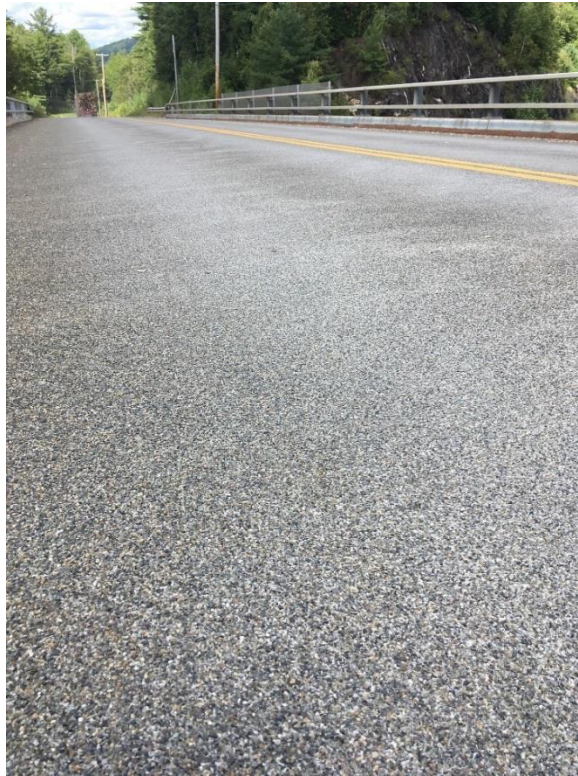
Figure 3: Close-up of bridge deck surface.

Figures 1 & 2 show the overall view of Bridge 8 from both the north and south, while Figure 3 shows a close-up view of the overlay surface. The excellent condition of the bridge deck surface and evidence of no new surface deterioration, except for some minimal wear in the wheelpaths, can be seen in the above figures. The wheelpaths showed minimal signs of raveling and smoother, less textured aggregate. Small amounts of loose aggregate, from the Flexogrid System surface, was found around the wheelpaths and alongside the bridge curb. The slight wearing to the wheelpaths can be seen in Figures 1 & 2 and the loose aggregate can also be seen in Figure 6. The amount of wear to the wheelpaths should not be viewed as a major blemish to the performance of the Flexogrid System considering that the system was installed during the spring of 2013 and endured 5 winter seasons of plowing. The adhesive adhering the aggregate to the bridge deck has performed well given the small amount of loose aggregate found during the site visit.