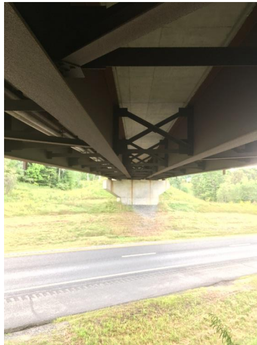
Figure 7: Full view of the underneath of the bridge.

Figure 6 shows the deterioration on the metal protection of the curb. Aggressive agents from run-off and winter maintenance has most likely attributed to the metal curb protector deterioration around the concrete curb. The extent of deterioration and corrosion seems minor and has been slow to progress. The rust and some of the holes were evident during the 2013 installation of the Flexogrid System. Photos from the installation of the overlay system can be found by reviewing the Installation Report .