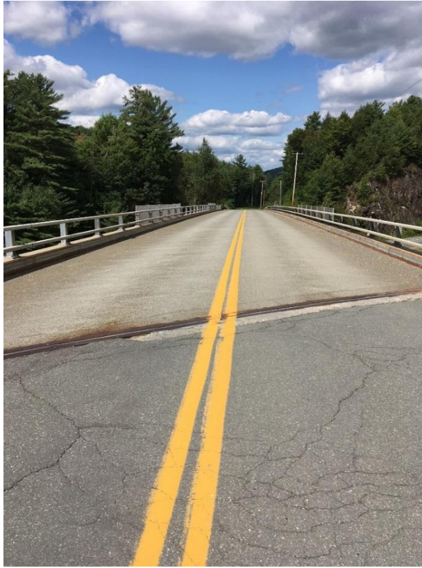
Figure 1: Overall View of Bridge 8 on Concord Ave. (TH 4), Waterford VT. Facing north over I-93.