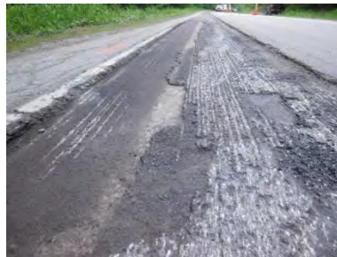
Figure 5: After cold planing.