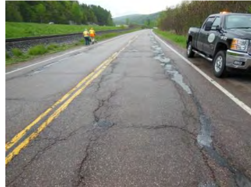
Figure 3: Test Site 3, looking EB.