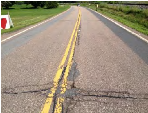
Figure 14: Test Site 2, looking WB.