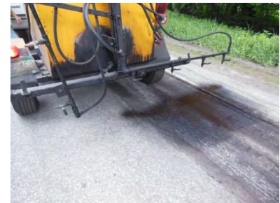
Figure 6: Spraying emulsion tack coat.