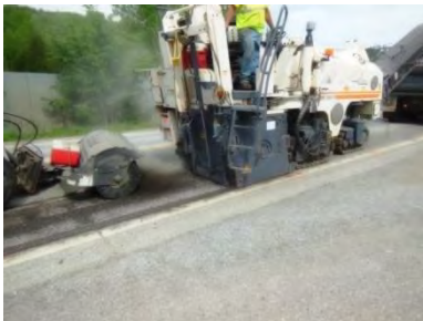
Figure 4: Cold planing and sweeping.

During construction Research personnel was onsite during the rehabilitation of each test site. Site conditions and construction activities were monitored and documented. Ruts were measured in between the cold planing and paving processes. The cold-planing and repaving process was free of any troubles. The pavement type used was a 50 blow Marshall hot mix asphalt. The repair process is shown in Figures 4-11 below.