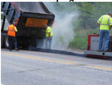
Figure 7: Paving.