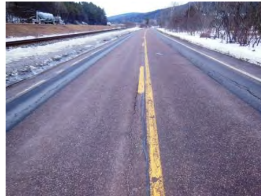
Figure 13: Test Site 3, looking EB.