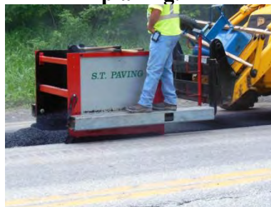
Figure 8: Paving Skid Box.