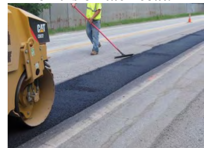
Figure 9: Squeegee and Compaction.