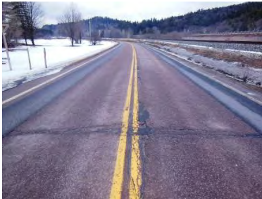
Figure 12: Test Site 2, looking WB.

The site was visited in March 2013 and July 2013 to evaluate the repair and measure rutting in each test site. Photographs and general observations were made at each visit. Test sites 2 and 3 are shown in Figures 12-15 below. Figures 12 and 13 depict each test site in March 2013 and Figures 14 and 15 show each in July 2013.