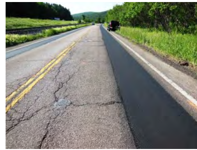
Figure 11: TS 3, Looking EB.