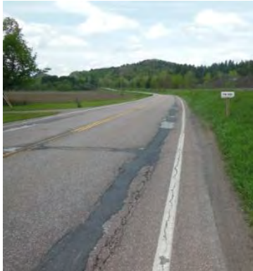
Figure 2: Test Site 2 looking WB.

Sections of US Route 2 have a concrete base underneath the pavement layers. To accurately evaluate the repair process, four two hundred foot test sections were chosen along US Route 2 to quantify existing distresses including cracking and rutting. Preexisting site conditions are shown in Figures 2 and 3 below.