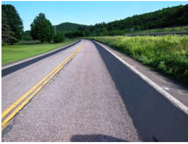
Figure 10: TS 2, Looking WB.