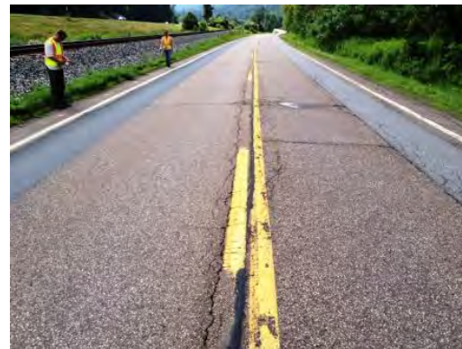
Figure 15: Test Site 3, looking EB.