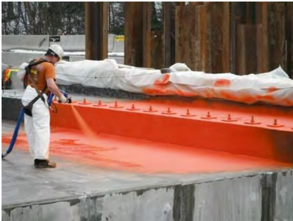
Figure 2 Spraying of the membrane