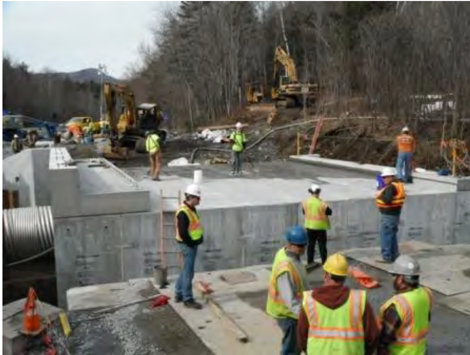
Figure 1 Installation of the BDM system, application of the primer

from the bridge deck, GS Bolton performed an inspection of the membrane on May 23 to ensure the gravel did not puncture or cause any weak spots. It was deemed in good shape. Binder and base courses of asphalt were placed on the bridge and approaches on June 6, and the top course on June 18, 2012.