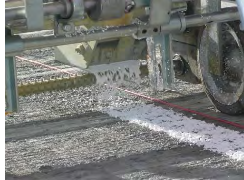
Figure 2: Spiked bar located on the handcart.

After the handcart passed, the optics were dropped onto the marking substrate (see Figure 3.) White markings typically provide higher retroreflective values due to the nature of pigments in white paint as compared to yellow. Because of this, the yellow markings used strictly Duralux beads whereas the white markings received a 50/50 blend of Duralux and Megalux beads. The white markings did not use strictly Duralux beads because these beads are much more expensive. Approximately 10 to 12 lbs of beads per gallon of MMA paint were applied. Figures 4-7 show the markings immediately following application (2).