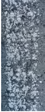
Figure 9: White edgeline on concrete.