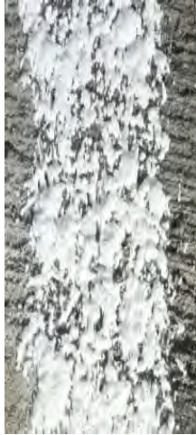
Figure 4: White edgeline on concrete