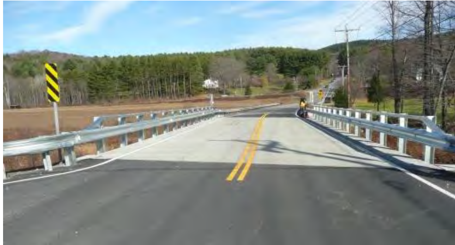
Figure 8: Bridge overview looking eastbound.

Retroreflectivity readings were taken on each line (white edge and yellow centerline) on both eastbound and westbound sides with the LTL 2000 Retroreflectometer and the results are displayed in Table 1.