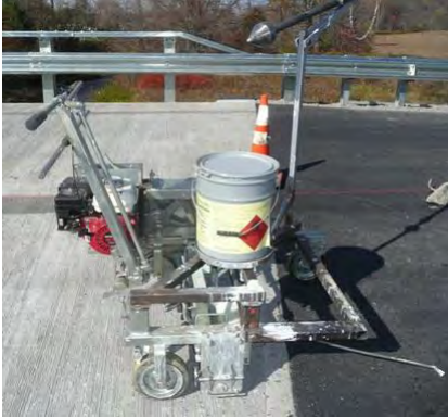
Figure 13: Push handcart applicator.