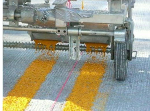
Figure 14: Spiked bar located on the handcart.