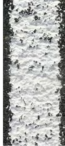
Figure 5: White edgeline on asphalt