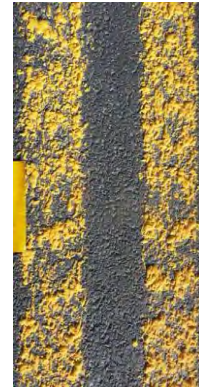
Figure 12: Yellow centerline on bituminous concrete.

The retroreflectivity values depict severe plow damage and a more gradual reduction throughout the summer. After speaking with product representatives from Aexcel Corporation, the marking manufacturer and Evonik Degussa, the resin supplier, the premature wear was presumably due to the roughness of the bare concrete bridge deck and the fact that not enough time may have elapsed between deck and asphalt approaches placement and marking application. Product representatives originally believed a 21 day curing time for the concrete was adequate (which was observed prior to marking placement), but after this failure reassessed this belief. Due to the unexpected wear and loss of reflectivity, Aexcel Corporation agreed to reapply the centerline markings. The reapplication was completed on Tuesday, October 11, 2011. Research personnel were onsite to document the process and take retroreflectivity readings. Figures 13 through 17 show the application and initial as-applied condition of the markings.