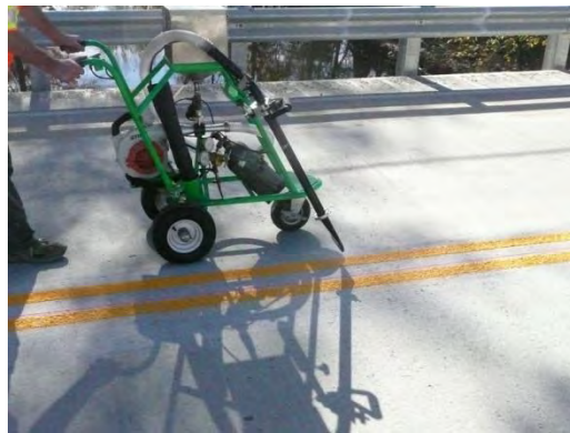
Figure 15: Bead applicator