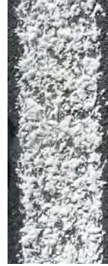
Figure 10: White edgeline on bituminous concrete.