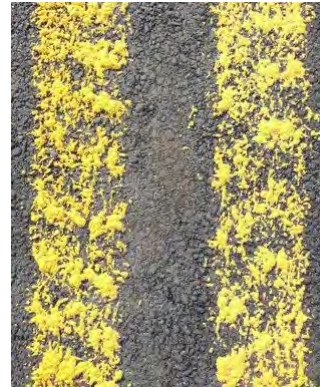
Figure 7: Yellow centerline on asphalt