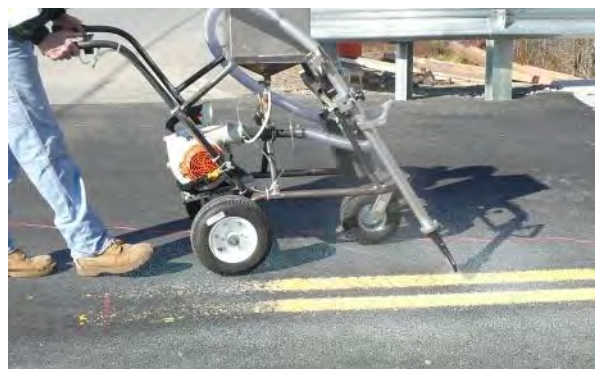
Figure 3: Bead applicator.

After the handcart passed, the optics were dropped onto the marking substrate (see Figure 3.) White markings typically provide higher retroreflective values due to the nature of pigments in white paint as compared to yellow. Because of this, the yellow markings used strictly Duralux beads whereas the white markings received a 50/50 blend of Duralux and Megalux beads. The white markings did not use strictly Duralux beads because these beads are much more expensive. Approximately 10 to 12 lbs of beads per gallon of MMA paint were applied. Figures 4-7 show the markings immediately following application (2).