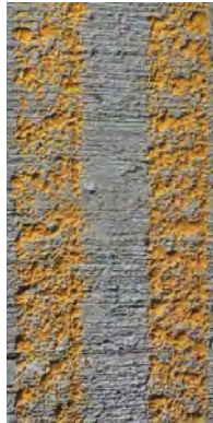
Figure 11: Yellow centerline on concrete.