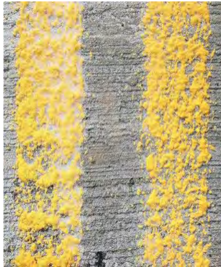
Figure 6: Yellow centerline on concrete