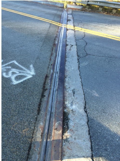
Figure 5: Cracking around bridge joints

The fourth site visit on June 9 th , 2016, showed very similar levels of wear to the first site visit a year earlier. The Flexogrid membrane had maintained good condition and showed no new signs of wear. The cracking around the bridge joint had increased slightly since the prior visit. Figure 6 shows the level of wear on the full bridge deck.