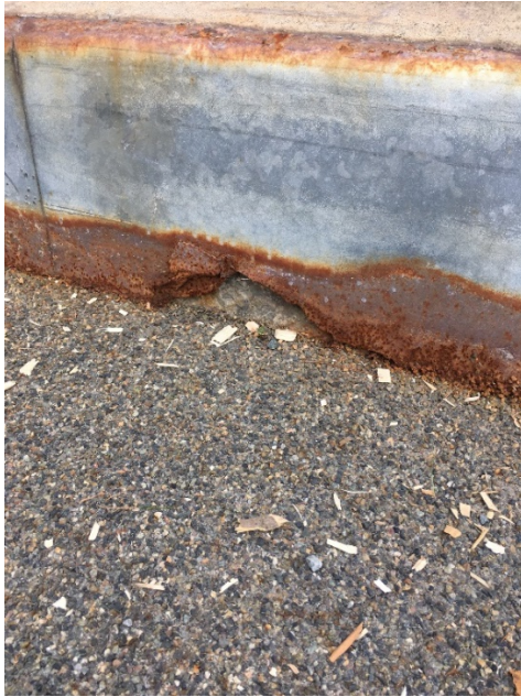
Figure 7: Loose aggregate from Flexgrid surface and rusting of metal curb protector