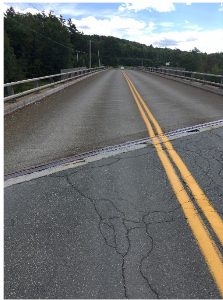
Figure 8: Cracking of southbound approach to bridge 8

Bridge inspection records ( here ) from September 2018 show the bridge to be in good condition, with the deck rated as good as well. Joint leaks were noted, but are unrelated to the Poly-carb overlay. Inspection photos ( here ) show no signs of membrane issues.