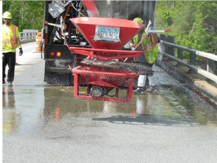
Figure 3: Flexogrid being Applied to the Deck