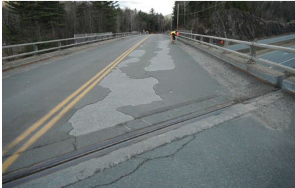
Figure 2: Condition of the previous bridge overlay in 2012