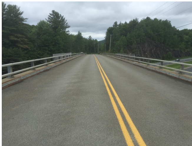
Figure 6: Overall view of Bridge 8 looking northbound

The fourth site visit on June 9 th , 2016, showed very similar levels of wear to the first site visit a year earlier. The Flexogrid membrane had maintained good condition and showed no new signs of wear. The cracking around the bridge joint had increased slightly since the prior visit. Figure 6 shows the level of wear on the full bridge deck.