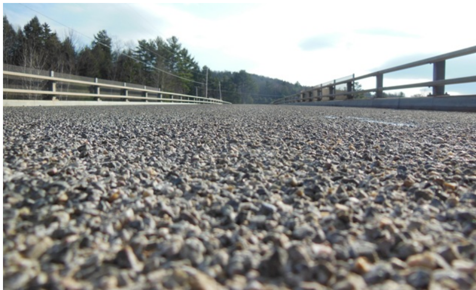
Figure 4: Surface texture of the Flexogrid