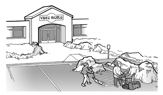
Clearing snow from all elements of an accessible parking space is essential to keeping it usable.

In order for an accessible parking space to be usable, all elements of the space must be free of obstructions: the vehicle space, the access aisle, the curb ramp, and the route that connects the parking to the accessible entrance of the building. Lack of maintenance of any one of those elements can make the whole space inaccessible. For example, for a wheelchair user to exit her car, she must place her wheelchair in the access aisle, transfer from the car seat to her wheelchair, and then roll backward in the access aisle to provide clearance to close the car door. If another car parks in the aisle or if a plow