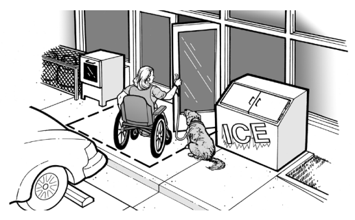
An accessible route to a door with maneuvering clearance maintained on the door's latch side makes entry possible for the customer who uses a mobility device.

While accessible routes through a store are originally well-planned, promotional, seasonal, and other special displays that surround entrances and spill into aisles may substantially reduce their accessibility. Customers with disabilities will not be able to shop in a store if the route through an entry plaza is too narrow because of a display of snow blowers, if the maneuvering clearance alongside the entrance door is blocked by a sale book rack, or if a route contains scattered trip hazards from impulse items displayed on cloth-covered tables or in baskets on the floor.