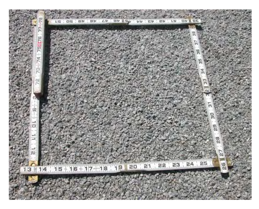
Figure 10 Surface Texture of the SafeLane® HDX Overlay