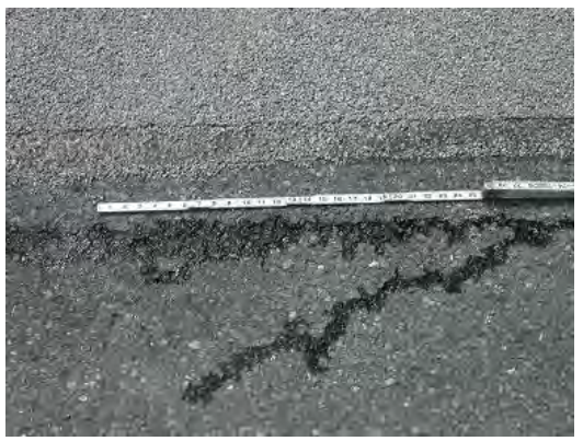
Figure 12: Water leaking from the centerline joint