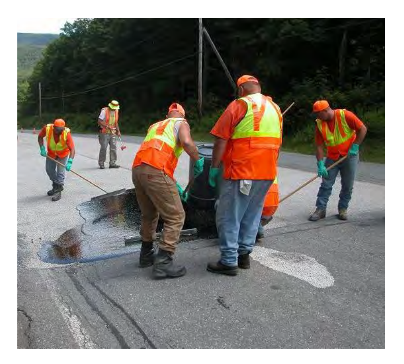
Figure 8 Placement of the second lift.