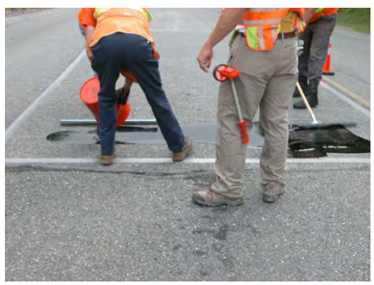
Figure 6 Spreading Epoxy