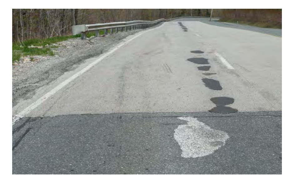
Figure 21 Pothole repair less than a year after application.

Crash data from 2000 and throughout the study period on to the present day was collected from the Traffic Research Section and local police records. Crash data indicated that where the overlay has been utilized, there has been no crashes and very few complaints about vehicles not being able to travel. Since the treatment was taken out in Searsburg, the District forces have noticed a considerable difference in travelers, mostly with multi-axle vehicles, not being able to reach the top of the incline.