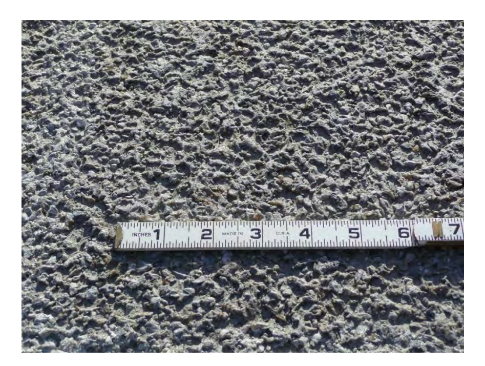
Figure 11 The texture of the SafeLane overlay after a year of service.