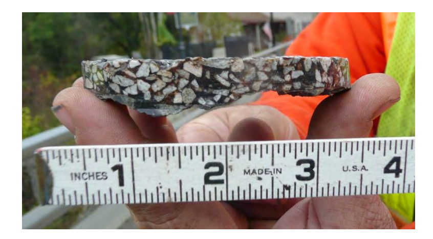
Figure 19 Core of the overlay.

Because of the premature failure in the wheelpaths, Cargill agreed to repair the overlay with a harder aggregate, which was projected to resist the wear of studded tire use more effectively. Due to time and weather constraints, the repair did not take place until August 2^{nd} and 3^{rd} , 2011. Research, District 5, Cargill, and Parent Construction representatives were onsite.