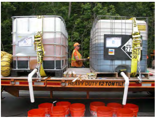
Figure 4 Part A and Part B