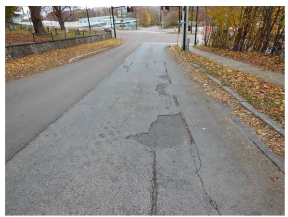
Figure 16 Application in 2013