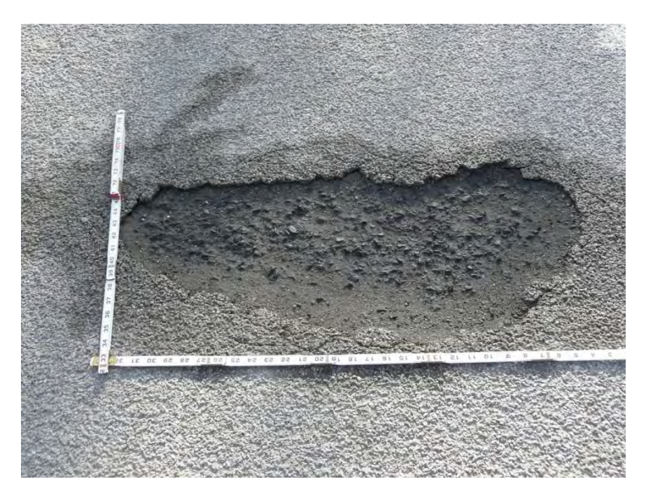
Figure 14 An example of a pothole. The underlying pavement was lifted out with the overlay.