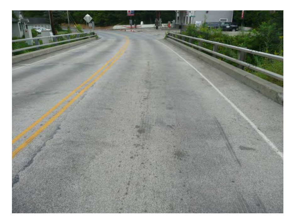
Figure 18 The darken wheel paths show where the aggregate has been stripped, exposing the underlying epoxy (2010).