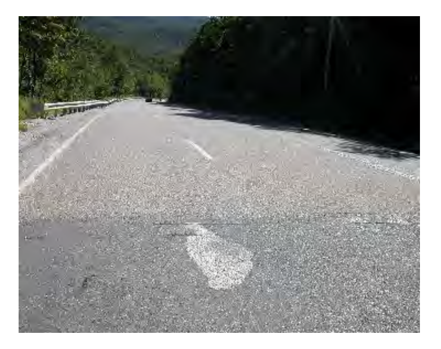
Figure 9 Completed overlay