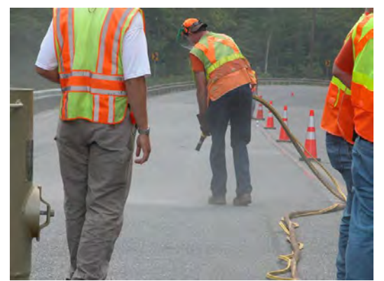
Figure 2 Sand Blasting

were then poured into a larger container in a 1 to 1 volumetric ratio and mixed using a large paddle mixer for approximately 3 minutes shown in Figure 5. Due to unfamiliarity with the product, the representative from the manufacturer had the workers start with a small load size of about 3.7 gallons.