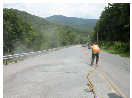
Figure 3 Air Compressor