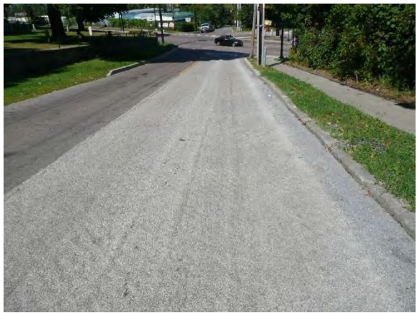
Figure 15 Overlay after application in 2008

apply the overlay. The first day involved milling the existing pavement to ensure the overlay would be flush with the surrounding pavement after completion. In the night after the milling process, a passing truck leaked oil onto the milled surface. As a result, the surface required shot blasting to ensure that the surface was clean in preparation of applying the overlay. Though the surface was properly prepared for the application of the material, the supplemental blasting left a ripple pattern on the surface of the overlay. Although the finish was not smooth and flat, the overlay was noted as being in good condition after placement. The site was visited periodically over the next 4 years. A considerable amount of cracking was noted in the last visit in March of 2012. No crashes or incidents have been reported between placement and the summer of 2012.