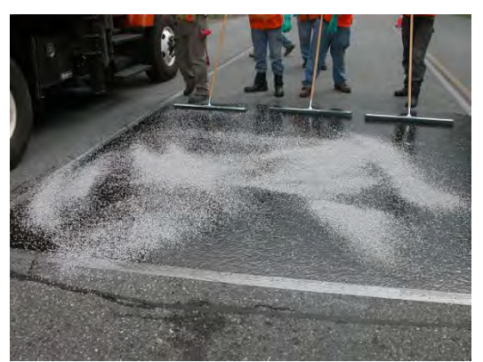
Figure 7 Spreading limestone

After the workers were familiar with the process, batches of 4.7 and 9.4 gallons of epoxy were used in the application, which sped up the process. After completion of the first course, an hour was allotted for the epoxy to cure to ensure proper compatibility for the second course. The pour of the first layer started at 9:11 AM and the section was finished at 10:57 AM. It is important to note that epoxy-curing times are dependent on the average temperature of the pavement and ambient temperatures.