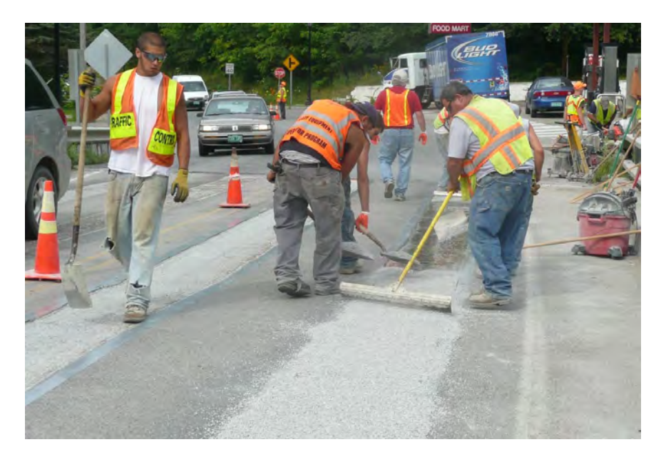
Figure 20 Reparing the wheel paths.

This research initiative was a joint effort between the VTrans Operations Division, the product manufacturer, Cargill<sup>TM</sup>, and VTrans Research. The cost of the overlay was $7 per square foot. Cargill donated 5000 ft<sup>2</sup> and VTrans paid $23,100 for the remaining 3300 ft<sup>2</sup> of material including the epoxy and aggregate. The Operations Division supplied traffic control and all labor and equipment required to apply the treatment. VTrans Research incurred all costs of evaluating the treatment.