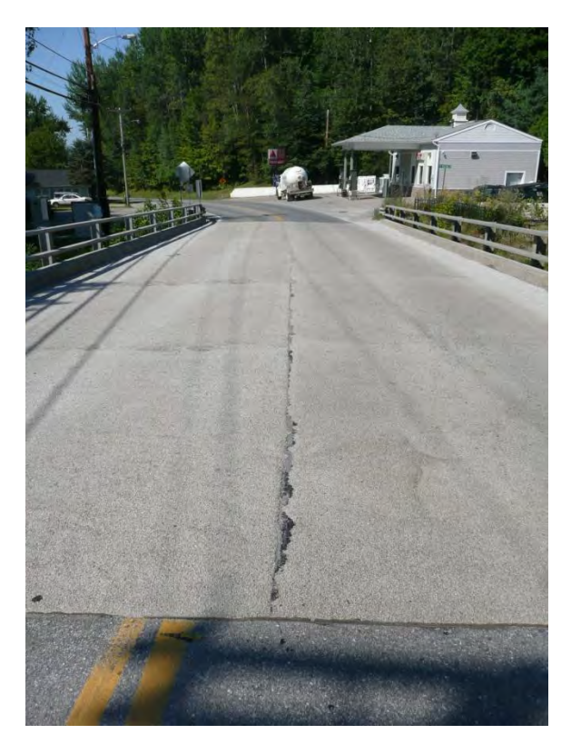
Figure 17 Application after installation in 2008

noted that the wheelpaths of the overlay were slippery. The surface was damp due to precipitation during morning hours. Upon furtherer examination, it was noted that within the wheelpaths, little aggregate remained on the surface of the experimental overlay. Instead, as shown in Figure 18, exposed epoxy was present in the majority of the surface of the overlay.