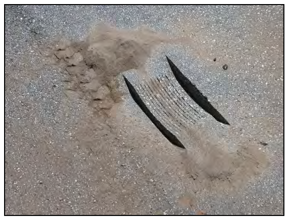
Figure 1 - Recess