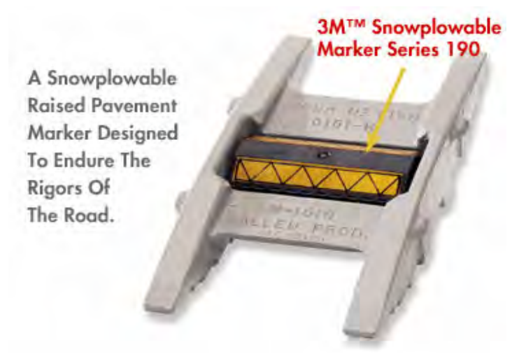
Figure 4 – Hallen Products – Model H1010 Raised Pavement Marker

Hallen Products – Model H1010 raised pavement markers, displayed in Figure 4, are also a narrow, "H-shaped" device designed with a low ramp angle for better plowability. The reflector Series 190 is made by 3M . According to the manufacturer, the markers are abrasion and impact resistant. The overall unit, shown in Figure 4, measures 10" long by 4.875" wide by 1.75" deep and weighs about 5.8 lbs. When installed, a total of 0.25" protrudes above the road surface. The body is comprised of nodular iron that conforms to American Society for Testing and Materials (ASTM) A536, "Specification for Ductile Iron Castings."