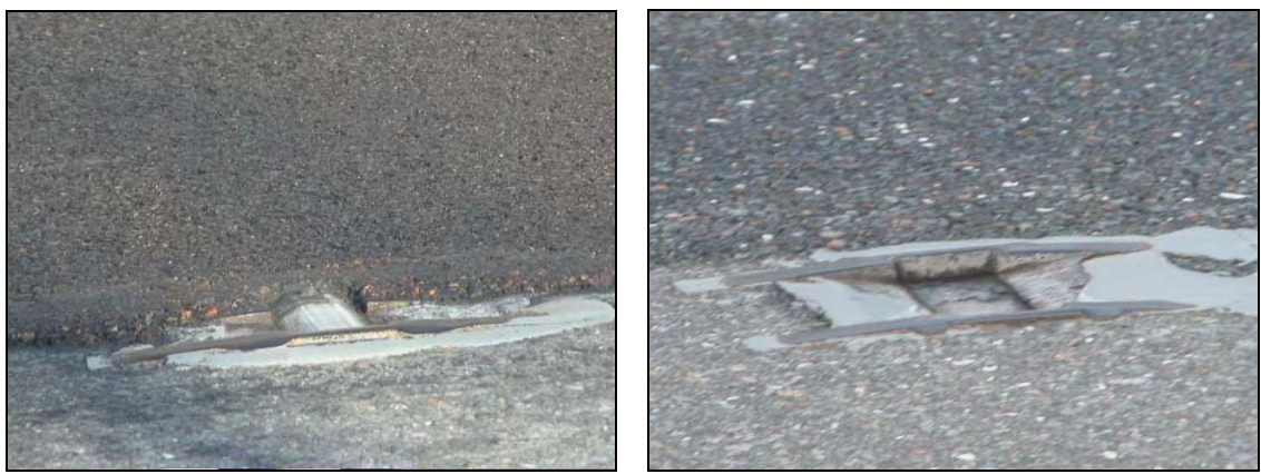
Figure 10 – Avery Dennison 101LPCR (2006)