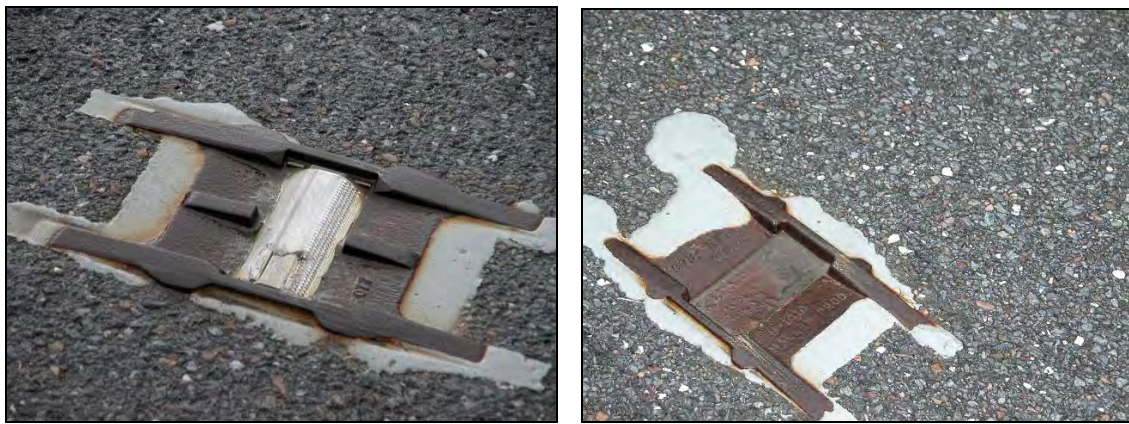
Figure 6 – Avery Dennison 101LPCR (2005)