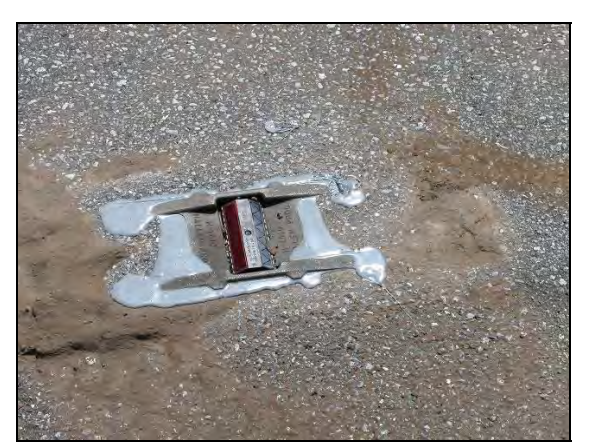
Figure 2 – Hallen Marker with Epoxy