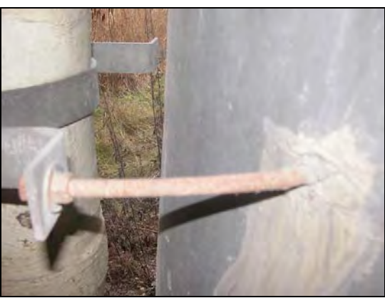
Figure 4 – Bolt Deformation

All lower supports were examined during the site visit and found to display signs of distress. As shown in Figure 4, the bolts that secure the drainage system to the pier were slightly deformed. This is most likely caused by shear forces generated from wind currents and bridge vibration. Section loss resulting from rust was also observed. Both will likely contribute to some form of stem or shear failure. When assessed by Peter Bergerson, he stated that the bolts were too small in diameter to withstand shear and vibratory forces.