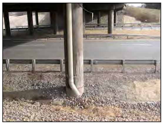
Figure 6 – Drainage on Dec. 2, 2003

During the inspection, runoff from the downspout was pooling around the bottom of the pier columns rather than draining away. This indicates that the stone fill drainage has failed. Figure 6 and 7 provide a comparison between the condition of the drainage system at the base of the piers at the time of installation and during the site visit conducted in December 2006. According to the Portland Cement Association, concrete absorbs water, which expands when it undergoes a freeze-thaw cycle and builds pressure. This internal pressure can cause damage to the concrete such as scaling and spalling. The infiltration of water also provides a mechanism for the penetration of destructive materials such as chloride and sulfate ions increasing the likelihood for concrete delamination and corrosion of reinforcing steel. Maintenance of the drainage system on at least an annual basis is recommended at this time.