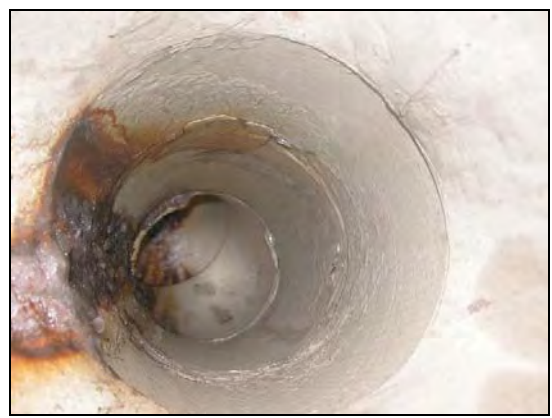
Figure 5 – Iron-Oxide Discoloration

During the inspection, runoff from the downspout was pooling around the bottom of the pier columns rather than draining away. This indicates that the stone fill drainage has failed. Figure 6 and 7 provide a comparison between the condition of the drainage system at the base of the piers at the time of installation and during the site visit conducted in December 2006. According to the Portland Cement Association, concrete absorbs water, which expands when it undergoes a freeze-thaw cycle and builds pressure. This internal pressure can cause damage to the concrete such as scaling and spalling. The infiltration of water also provides a mechanism for the penetration of destructive materials such as chloride and sulfate ions increasing the likelihood for concrete delamination and corrosion of reinforcing steel. Maintenance of the drainage system on at least an annual basis is recommended at this time.