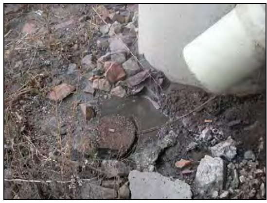
Figure 7 – Drainage on Dec. 19, 2006