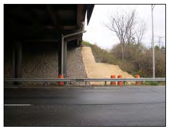
Figure 8 – After Installation