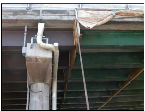
Figure 2 – Installation