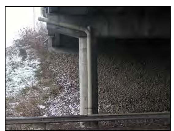
Figure 9 – On Dec. 19, 2006