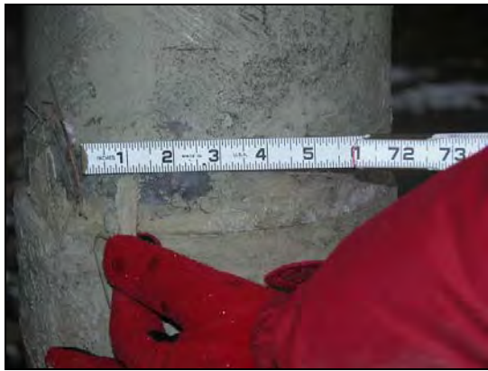
Figure 3 – Flaking of Adhesive

was contacted to discuss this phenomenon. They explained that the resin adhesive will not adhere to the glazed finish on the exterior of the pipe. Furthermore, the resin is only needed for the bond between fittings and is not intended to be applied beyond the joint.