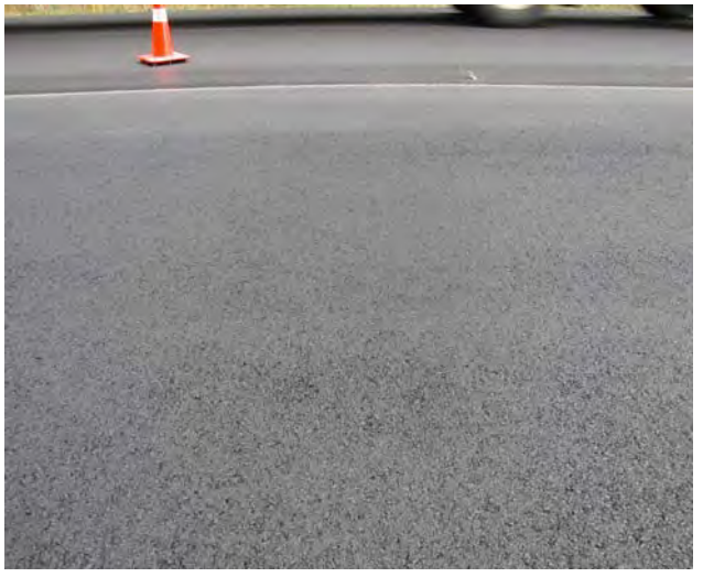
Figure 1 434' 7" Up-station from mm 95.65