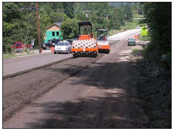
Figure 5 – Reclaimed Base Compaction

It is important to note that during the second reclaim pass, on July 22, 2007 from MM 5.047 to MM 4.88 in Duxbury a rain event occurred. Gorman Brothers stopped for several hours before deciding to stop completely for the day. They did however return later in the day to maintain the gravel road where substantial potholes had developed. Test Site 5 at MM 4.96 lies within the section that experienced a rain event during the reclaiming process. As of this time no conclusions can be drawn pertaining to whether or not this rain event had a substantial effect on the performance of the treatment in the section.