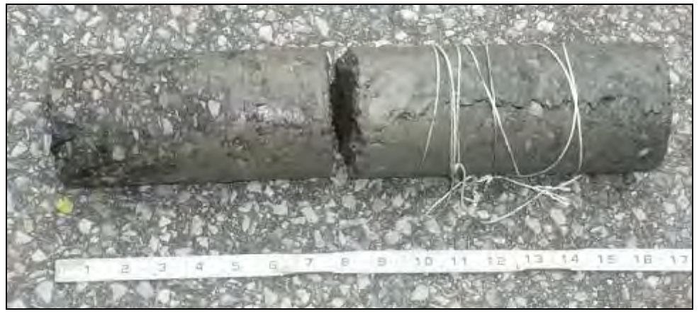
Figure 6 Core Extracted Over Crack

Of the three cores removed over observed surface cracks within the pavement, two were found to contain cracking that extended down to the base of the reclaimed layer. The width and appearance of the cracks were also found to be greater and more distinct within the reclaimed layer indicating that the cracks are bottom-up cracks, or cracks that propagated from the reclaimed layer into the bituminous concrete pavement. In addition, the majority of the cracks may be due to shrinkage or some form of thermal crack. A photograph of a core extracted over a crack is shown in Figure 6. The estimated width of this crack is 0.030 inches. The photograph shows roughly 8 inches of pavement (on the lefthand side) and 8 inches of reclaimed base (on the right).