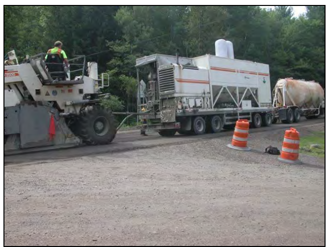
Figure 4 – Recycling Train