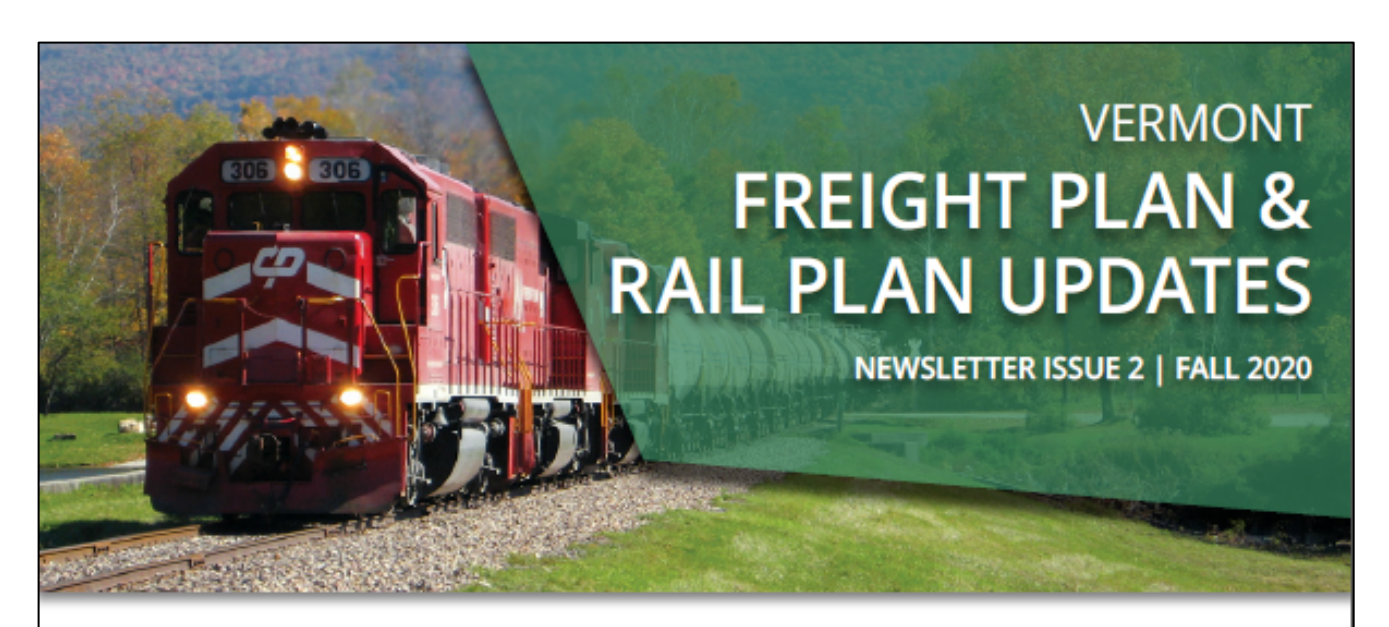
FIGURE 2.2 NEWSLETTER ISSUE 2 EXAMPLE