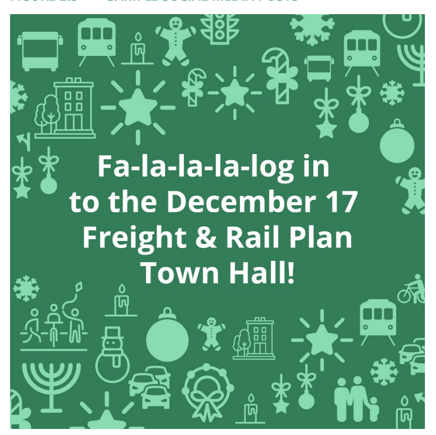
FIGURE 2.3 SAMPLE SOCIAL MEDIA POSTS