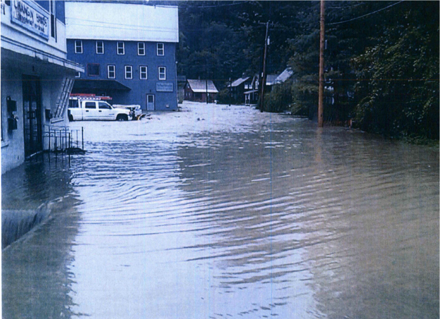
Williams Street closure due to flood inundation along Whetstone Brook during Tropical Storm Irene.

PROJECT OUTCOMES: • A method to systematically identify road segments, bridges, and culverts that are vulnerable to flood and erosion damages; • A screen to pinpoint the most critical locations and mitigation options on the transportation network; and • A web-based application to display risk information.