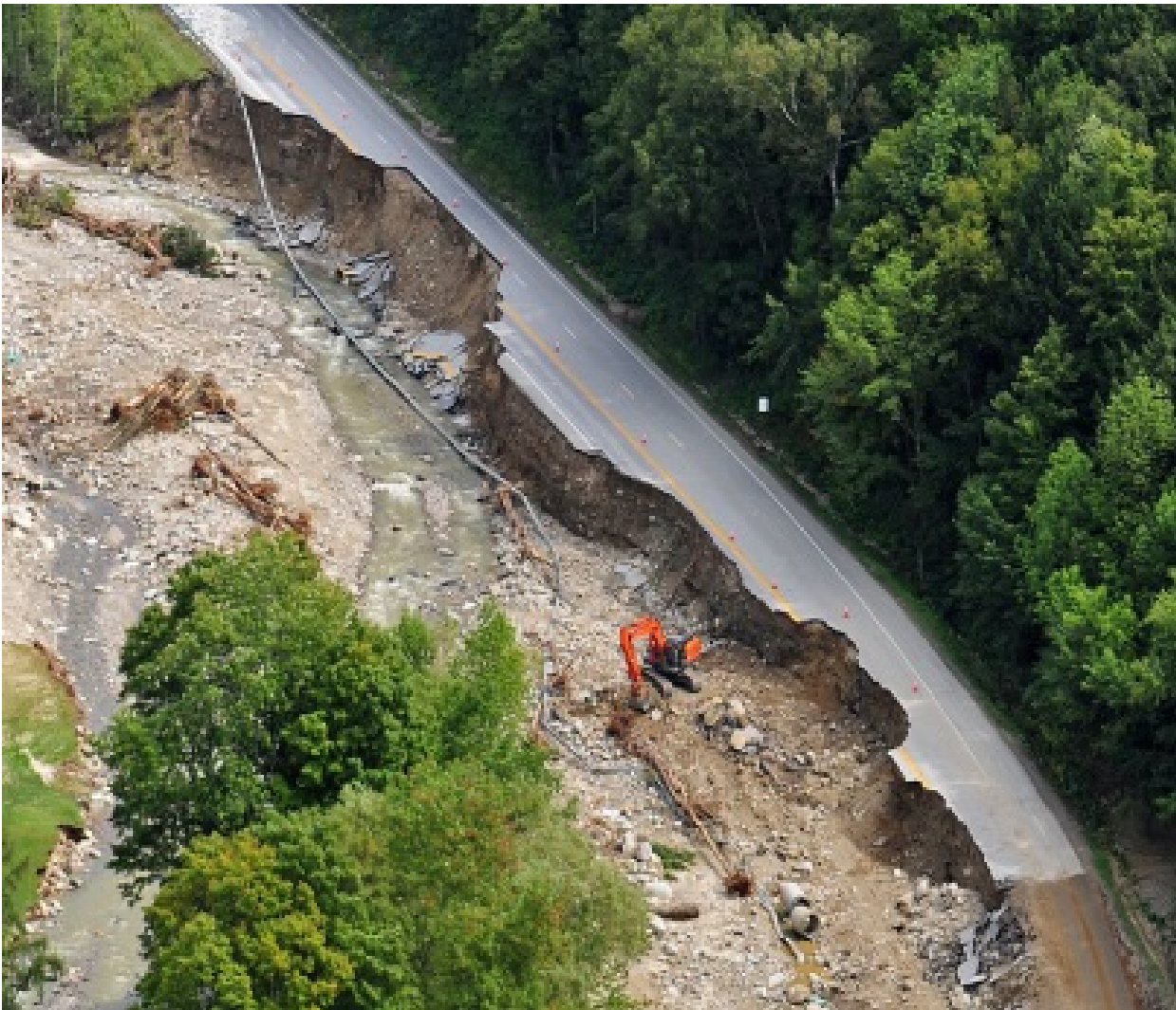
Route 4 failure due to erosion on Mendon Brook during Tropical Storm Irene.

The results of this innovative, multi-discipline project may be used for project identification and planning, project prioritization, budgeting, resource and asset management, initial site assessment, starting the design alternatives analysis, emergency planning, recovery planning, conservation planning, and planning for continuity of business and future housing.