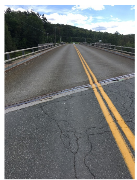
Figure 8: Cracking of southbound approach to bridge 8

Bridge inspection records (<u>here</u>) from September 2018 show the bridge to be in good condition, with the deck rated as good as well. Joint leaks were noted, but are unrelated to the Poly-carb overlay. Inspection photos (<u>here</u>) show no signs of membrane issues.