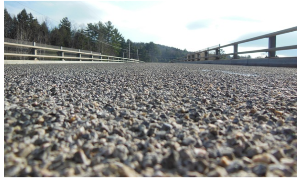
Figure 4: Surface texture of the Flexogrid