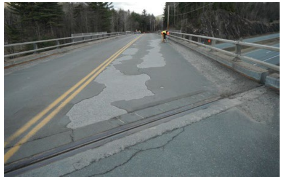
Figure 2: Condition of the previous bridge overlay in 2012