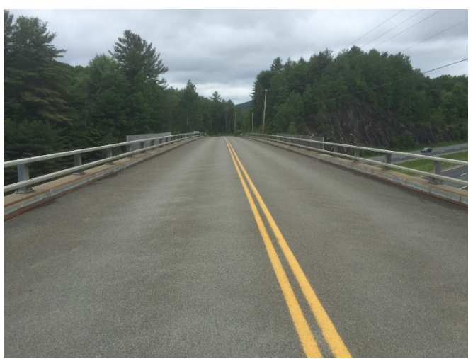
Figure 6: Overall view of Bridge 8 looking northbound

The fourth site visit on June 9<sup>th</sup>, 2016, showed very similar levels of wear to the first site visit a year earlier. The Flexogrid membrane had maintained good condition and showed no new signs of wear. The cracking around the bridge joint had increased slightly since the prior visit. Figure 6 shows the level of wear on the full bridge deck.