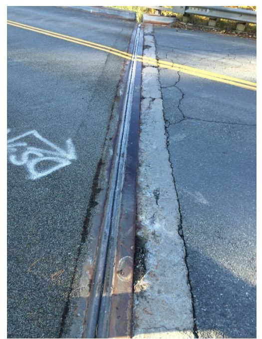
Figure 5: Cracking around bridge joints

The fourth site visit on June 9<sup>th</sup>, 2016, showed very similar levels of wear to the first site visit a year earlier. The Flexogrid membrane had maintained good condition and showed no new signs of wear. The cracking around the bridge joint had increased slightly since the prior visit. Figure 6 shows the level of wear on the full bridge deck.