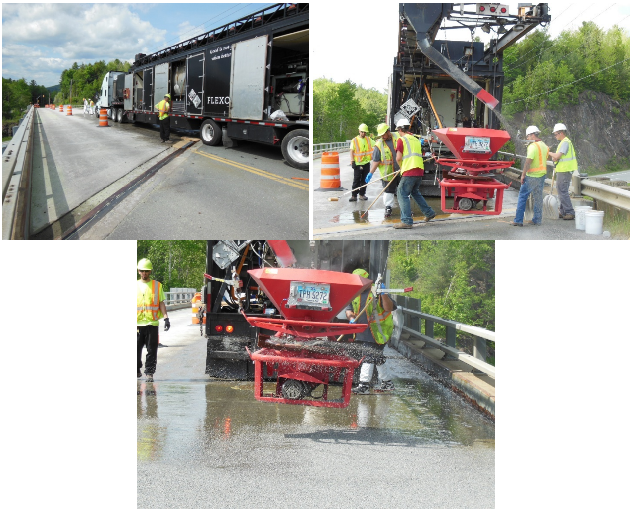
Figure 3: Flexogrid being Applied to the Deck