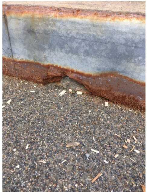
Figure 7: Loose aggregate from Flexogrid surface and rusting of metal curb protector