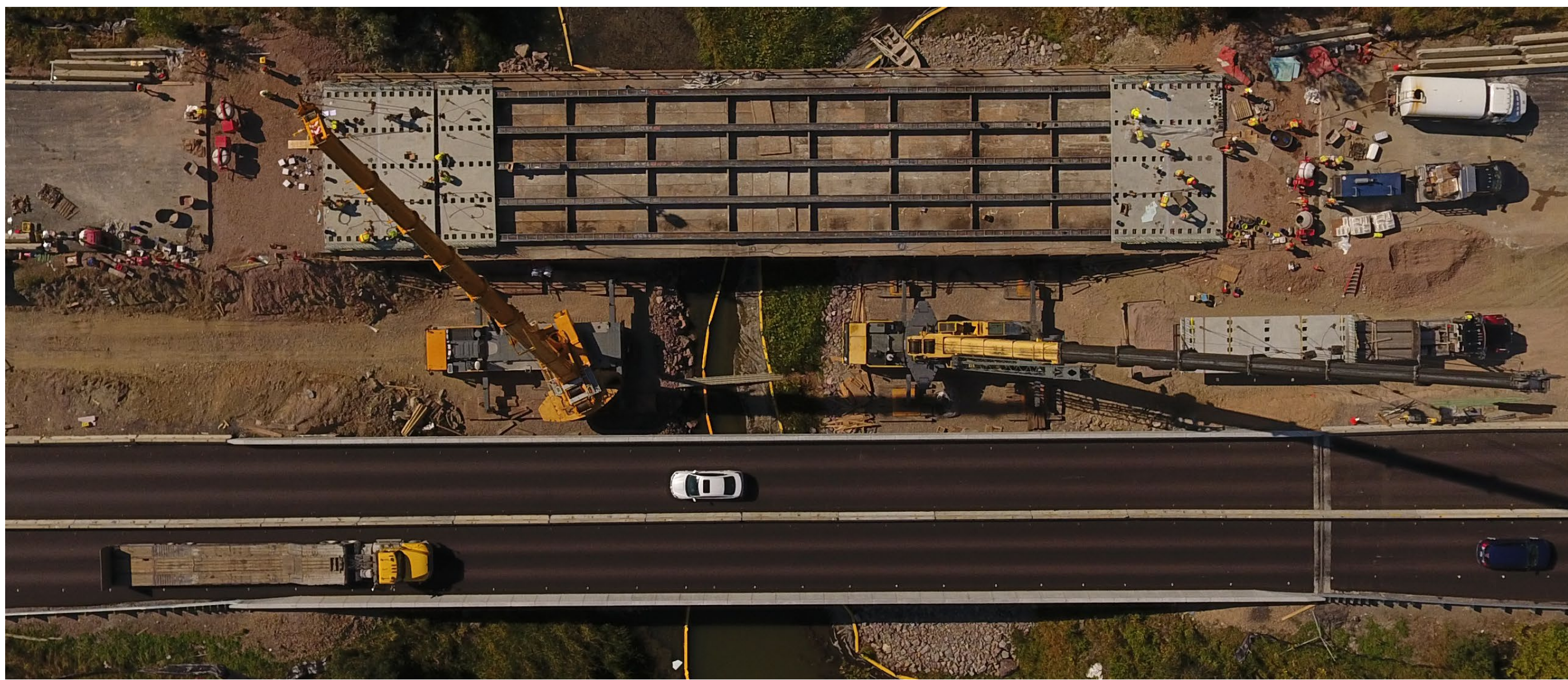
Figure 1. Precast deck panel erection is in progress

An accelerated bridge construction project requires seamless coordination and execution of many construction activities. Technologies simple for construction are the keys to project success. The AccelBridge precast deck system is developed to simplify construction and minimize field operations.