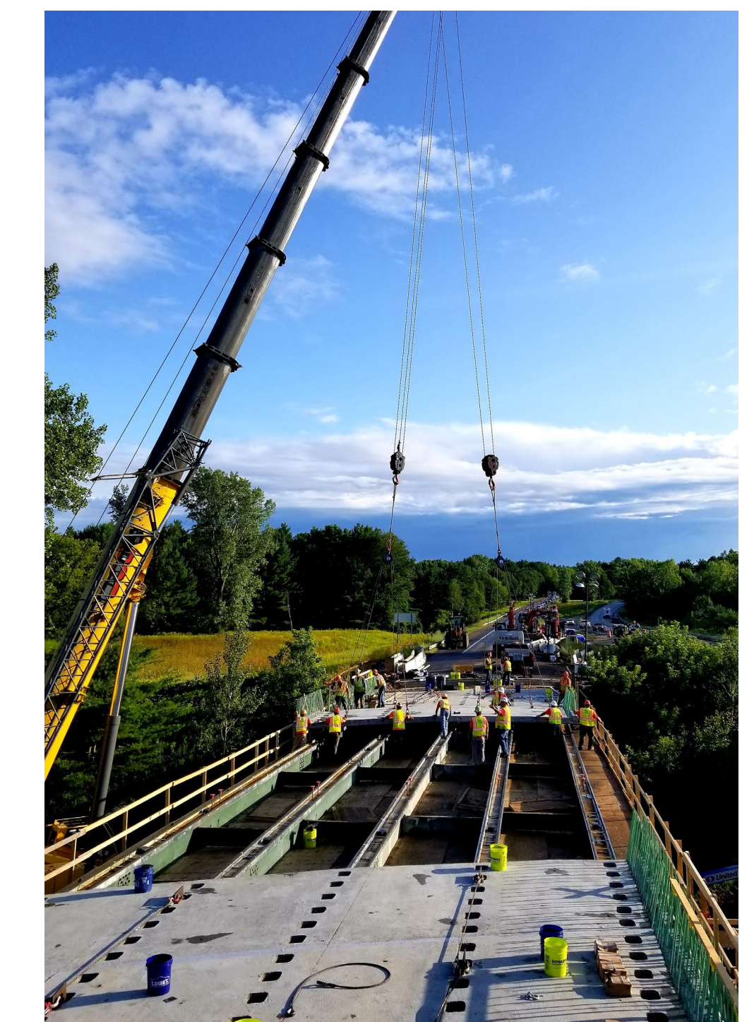
Figure 5. Placing deck panels by crane.