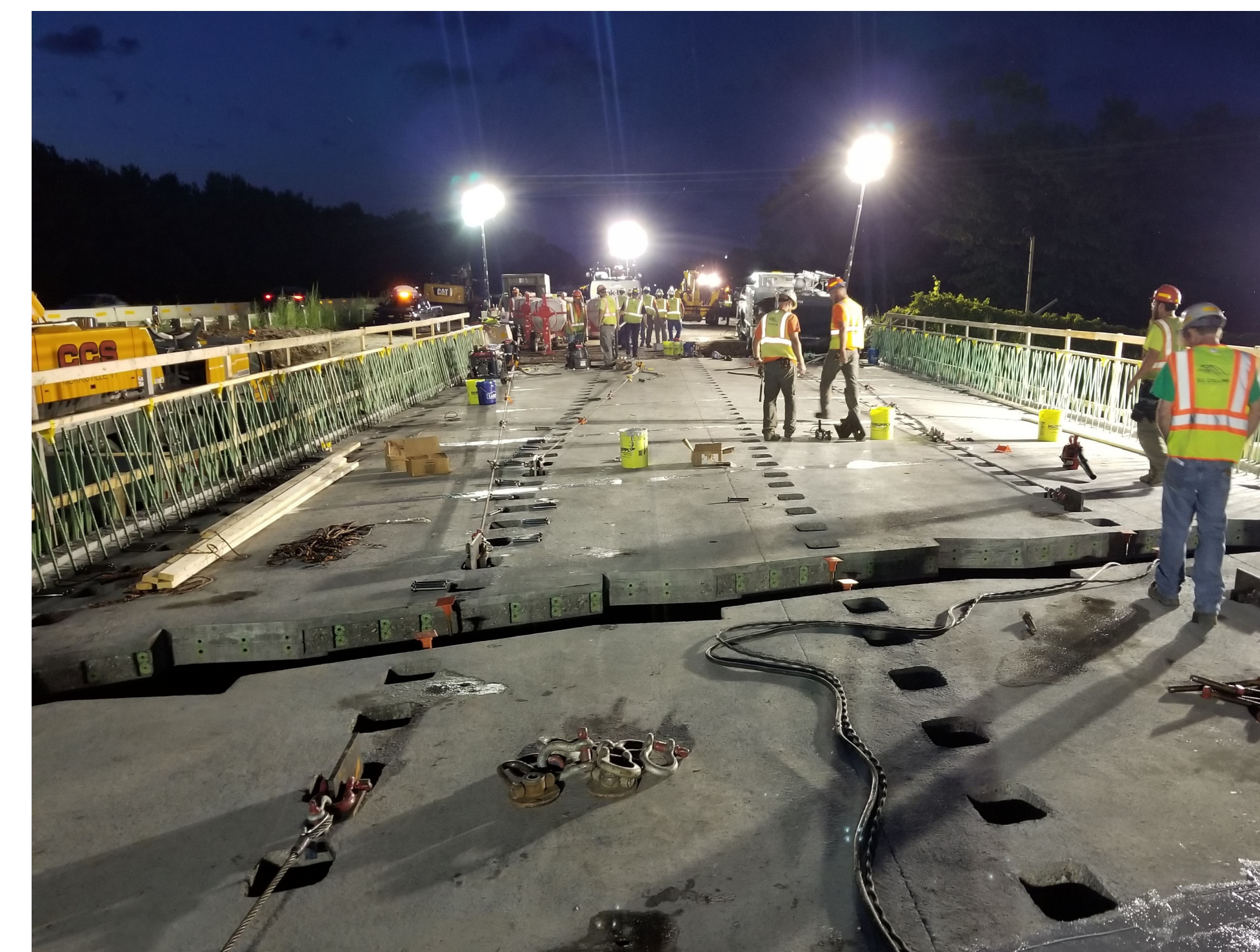
Figure 4. Deck erection completed and ready for jacking

The Colchester I-89 Bridges Project was a rehabilitation of four existing bridges located on the busiest interstate segment in Vermont. Rehabilitation of these bridges included replacement of heavily deteriorated bridge decks with new precast deck panels, steel repairs, as well as replacement of the bridge backwalls, approach slabs, and sleeper slabs. The Vermont Agency of Transportation (VTTrans) allotted for six separate weekend shutdowns to perform the rehabilitation work on four separate bridges. All four bridges were replaced on time and within budget.