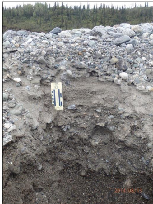
Figure 2: Example of Bed Armor Layer and substrate layers