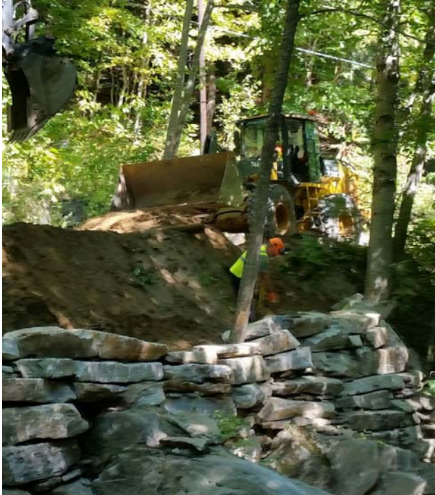
Installation of a Better Roads grant project in Chester, VT

If you have questions, would like more information or to request technical assistance, please contact: