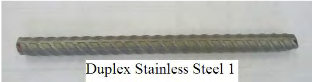
Figure 1 (cont.) Images of each bar in series 1 in their final condition following 260 salt-water immersion cycles.