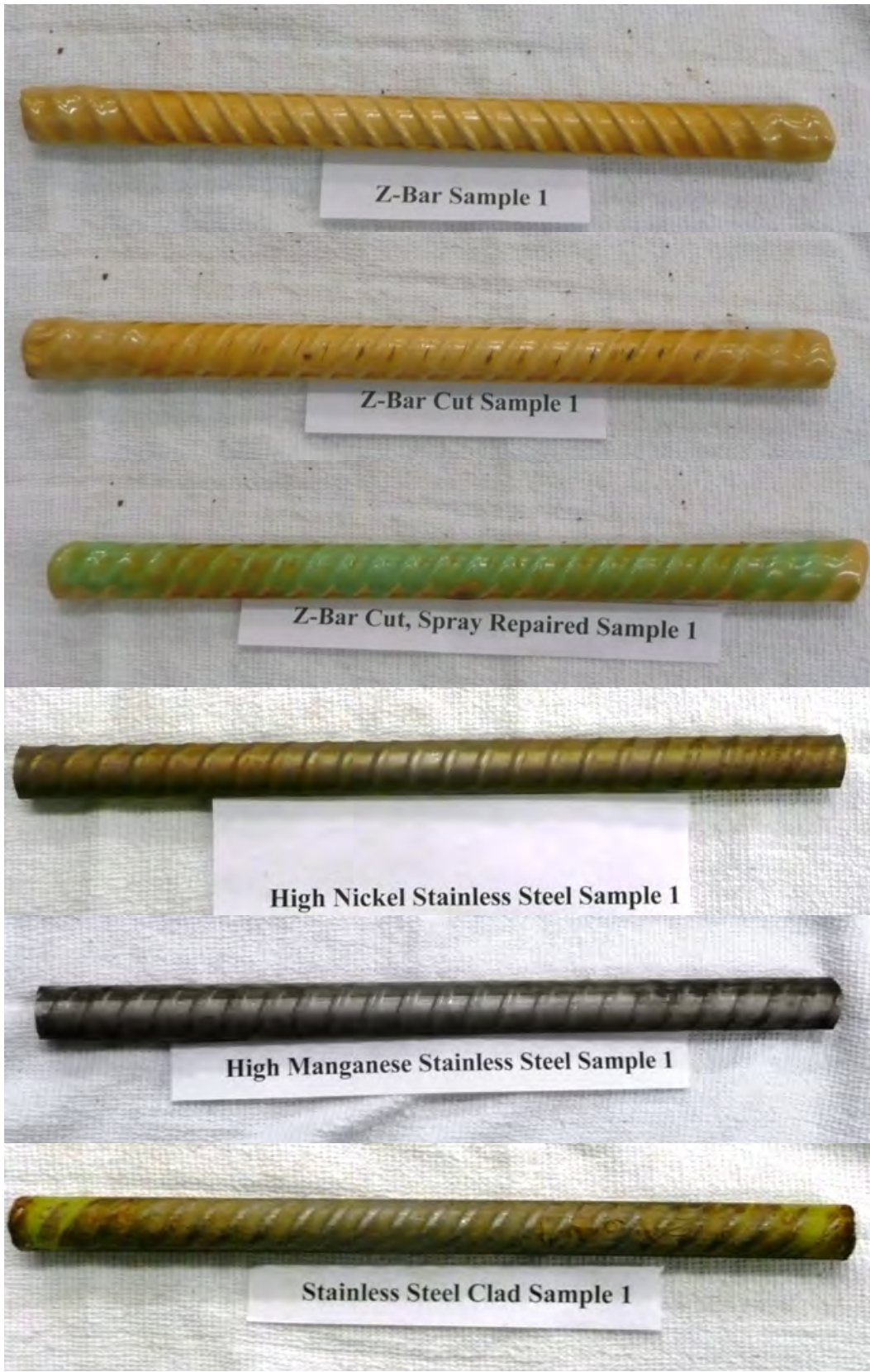
Figure 1 (cont.) Images of each bar in series 1 in their final condition following 260 salt water immersion cycles.