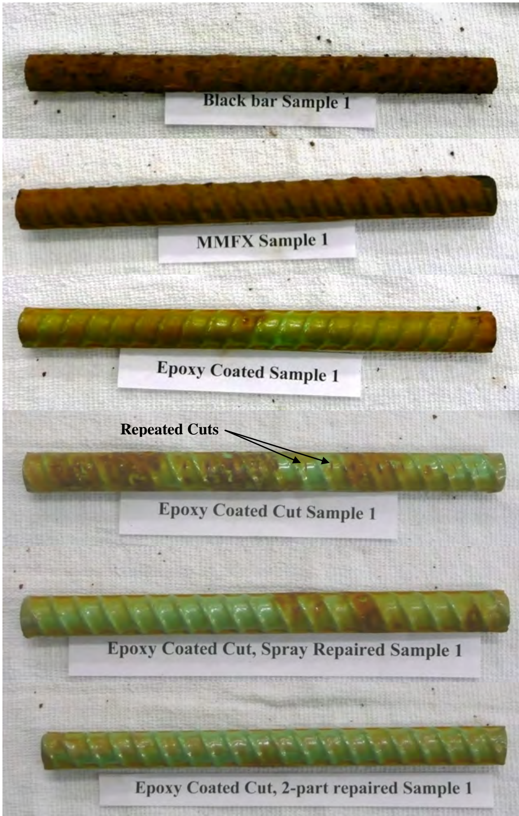
Figure 1. Images of each bar in series 1 in their final condition following 260 salt water immersion cycles.