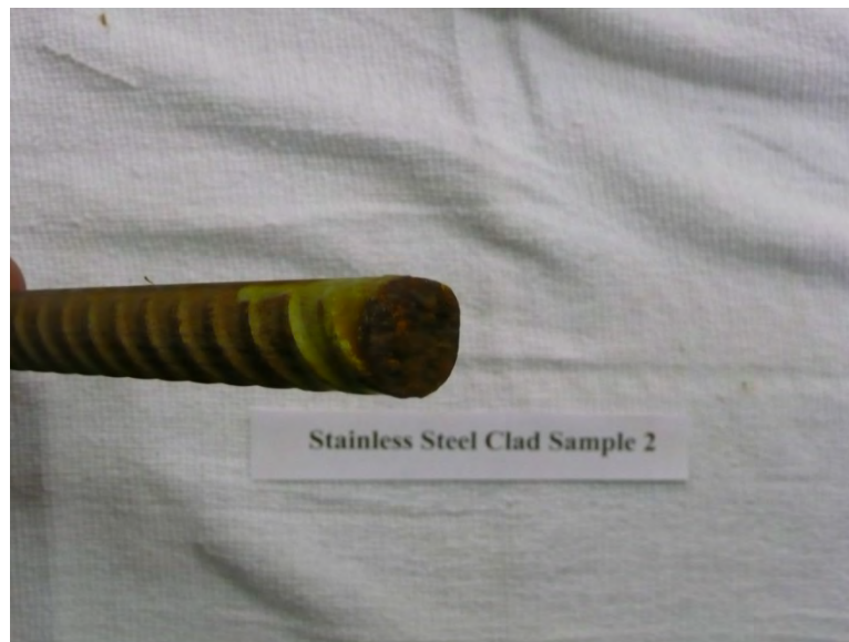
Figure 2 (cont.) The cut end of a stainless clad reinforcing bar showed signs of corrosion.

Stainless Steel proved to be the best performers in the study. Due to the non-magnetic material, the coating thickness was not measured for all sample types. However, visual inspection (see figure 1) showed that the bars were resistant to corrosion. There was virtually no corrosive buildup or any signs of deterioration. The stainless clad reinforcing did exhibit some significant corrosion at the cut ends (see figure 2). As seen in figures 1 and 2, the clad bar was treated by dipping the ends into an epoxy liquid; however, this proved to be insufficient to protect the bar. Solid Stainless Steel reinforcement will provide the maximum life expectancy. Because of the cut ends, the clad reinforcement will need a thick application of epoxy coating at the cut ends to have the same life expectancy as the stainless steel reinforcing.