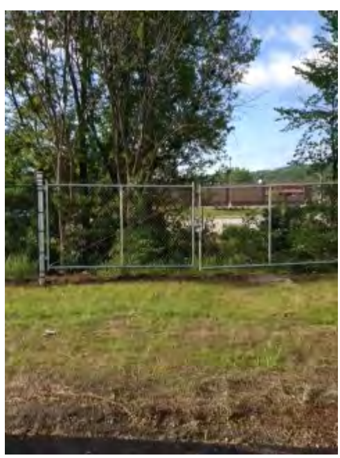
Posts in place for gate