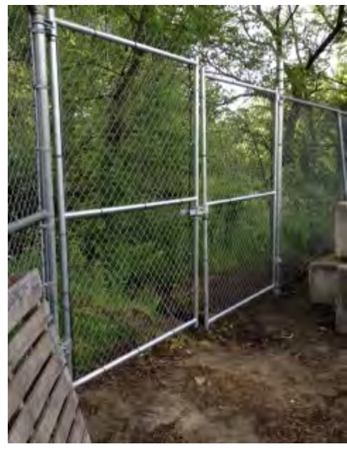
Boat Launch Gate