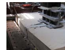
Figure 5. Panel fabrication and testing