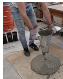
Figure 3. Spread test