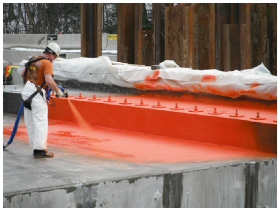
Figure 3: Application of the spray-on membrane (March 12, 2012)