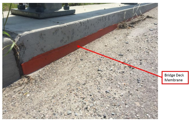
Figure 10: Bridge deck membrane (June 2, 2016)