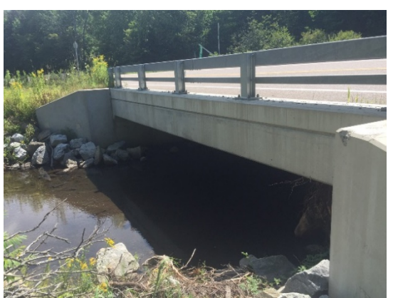
Figure 14: View of left side of bridge, facing north (August 15, 2017)