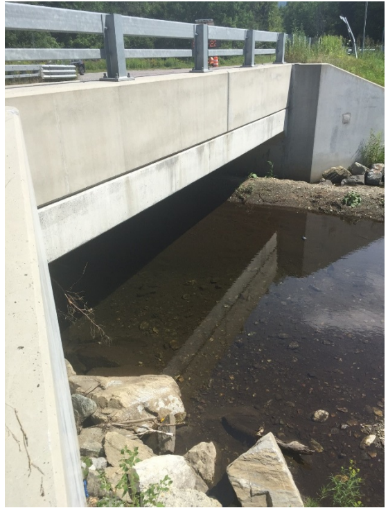
Figure 13: View of right side of bridge, facing south (August 15, 2017)