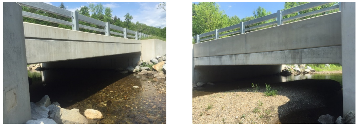
Figure 5: Overall view of Bridge 165 on VT 100 in Warren (June 2, 2016)

A site visit to bridge was conducted on June 2^{nd} , 2016, four years after construction. Observations and photos on the performance and appearance of the BDM after installation were collected and can be seen in Figures 5 - 12. Figures 1 & 2 show the overall view of Bridge 165 from both sides. Figures 6 – 10 show the overall condition of the bridge deck overlay. Figure 11 shows evidence of the BDM on the side of the asphalt overlay. Figure 12 shows a close-up view of the underside of the concrete bridge. Figures 8 and 9 show longitudinal cracking on the bridge overlay.