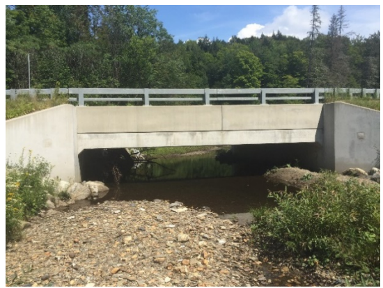
Figure 12: View of Bridge 165 on VT 100 in Warren, right side (August 15, 2017)

A site visit to bridge 165 in Warren was conducted on August 15<sup>th</sup>, 2017. Observations and photos on the performance and appearance of the Bridge Deck Membrane (BDM) after installation were collected and can be seen in Figures 12 - 19. Figures 12-14 show the overall view of Bridge 165 from both sides. Figures 15 – 18 show the overall condition of the bridge deck overlay. Figure 18 shows evidence of the BDM on the side of the concrete curb above the asphalt overlay. Figure 19 shows a close-up view of the underside of the concrete bridge and the wood debris that has collected on the north end, which can also be seen in Figure 14. Figure 17 show longitudinal cracking on the deck overlay.