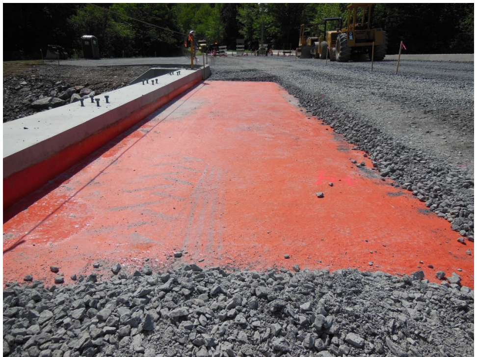
Figure 4: BDM with gravel cover (June 1, 2012)