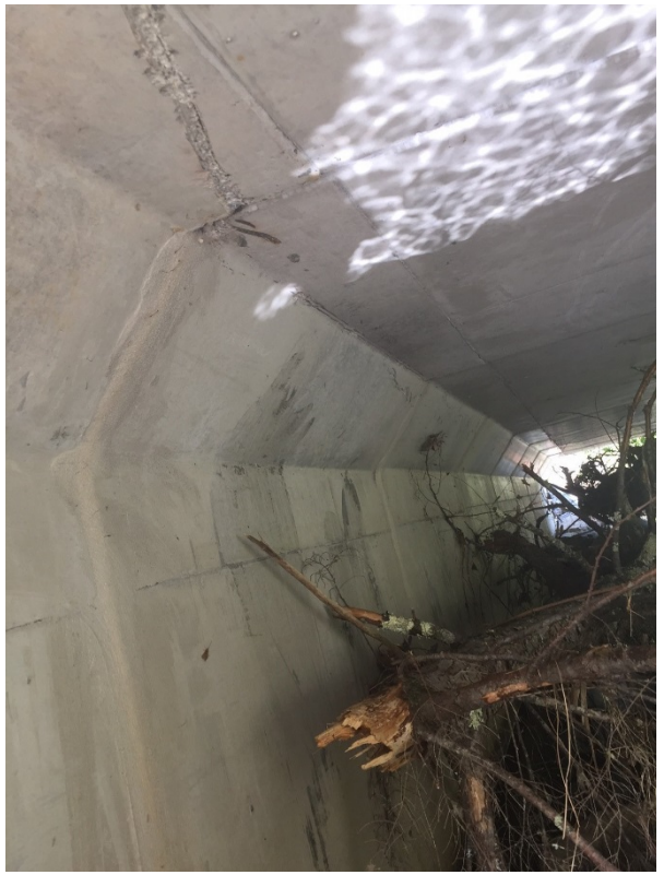
Figure 19: Underside with debris (August 15, 2017)

From the visual inspection and photographic evidence, the BDM has been working properly. The only signs of deterioration are several longitudinal cracks on the pavement surface. As previously stated from the 2016 field visit, it was observed and monitored that the longitudinal cracking occurring in the surrounding asphalt overlay, again emphasizing the fact that the cracking could be attributed to the material properties of the asphalt overlay and not the bridge deck membrane. The site visit showed the single longitudinal crack on the southbound lane and eight longitudinal cracks on the northbound lane. The crack on the southbound side was located on the south end of the bridge, in the center of the wheel path, and was approximately 12ft long. The northbound lane had two cracks in the wheel path and one between the wheel paths, three cracks near the mid-span of the bridge within the wheel path that were approximately 9, 12 and 15ft long, and two cracks on the north end of the bridge in the center of the wheel path that were 6 and 12ft long. The centerline crack that runs the whole length of the bridge was again evident.