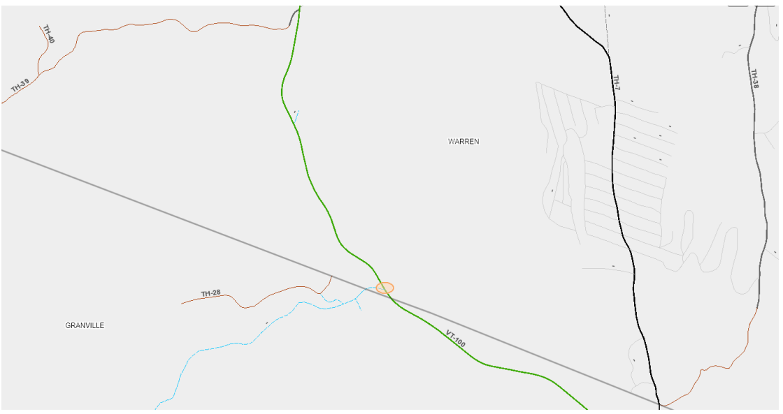
Figure 1: Location of Project, bridge 165 in the town of Warren

The BDM system was used on one bridge replacement project, Warren ER-STP 013-4(36), bridge number 165 on VT 100 in the town of Warren, 50 feet north of the Warren and Granville town line (Figure 1). The bridge was produced under rapid construction techniques. The bridge is 21 feet long by 34 feet wide and has a reported average annual daily traffic (AADT) of 980.