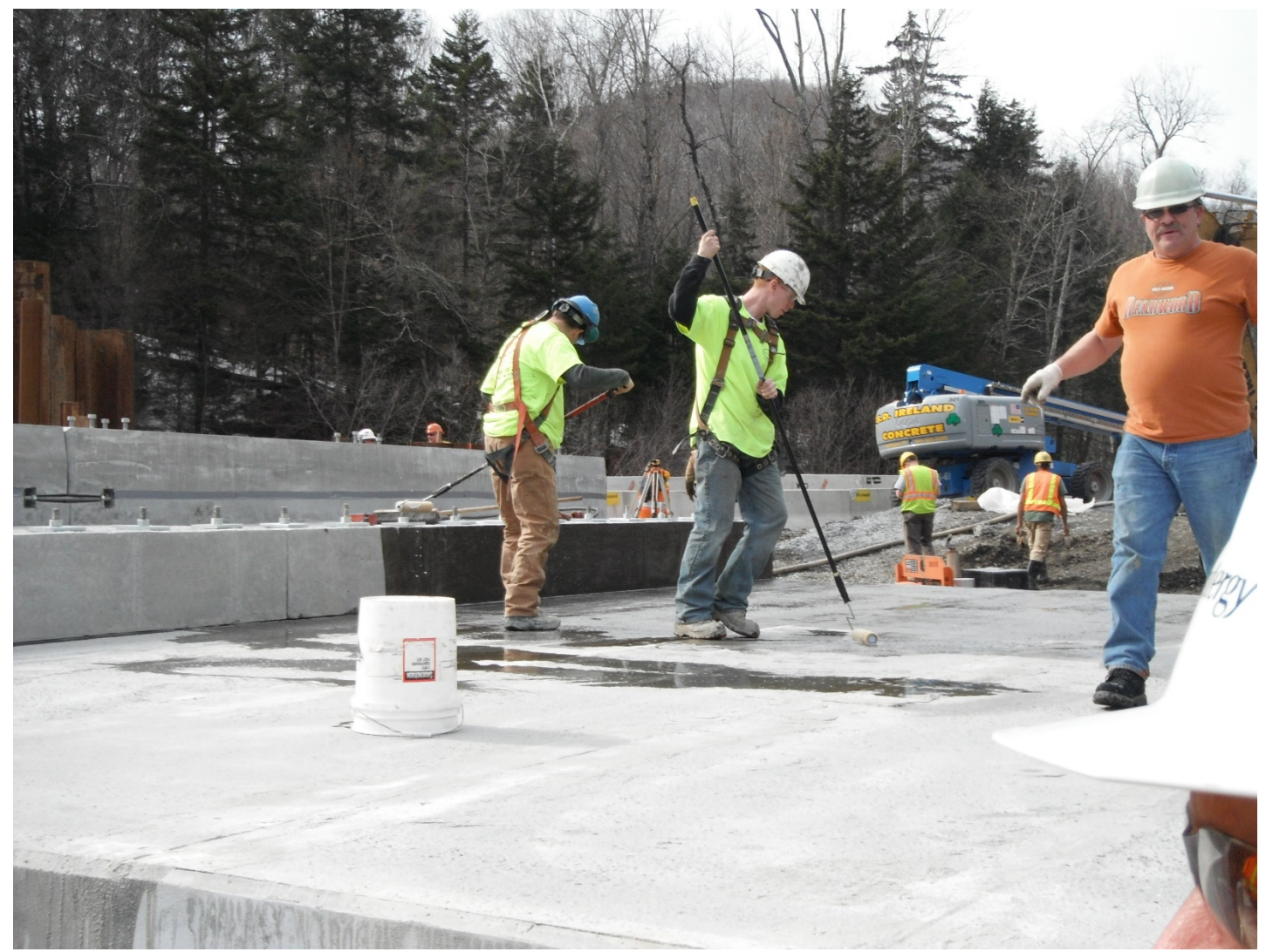
Figure 2: Installation of the BDM system, application of the primer (March 12, 2012)

the onset of warmer weather in May, the bridge was again closed to traffic to begin paving activities. Once the gravel was removed from the bridge deck, GS Bolton performed an inspection of the membrane on May 23 to ensure the gravel did not puncture or cause any weak spots. The membrane was deemed to be in good shape, with no damage from the gravel evident (Figure 4). Binder and base courses of asphalt were placed on the bridge and approaches on June 6, and the top course on June 18, 2012.