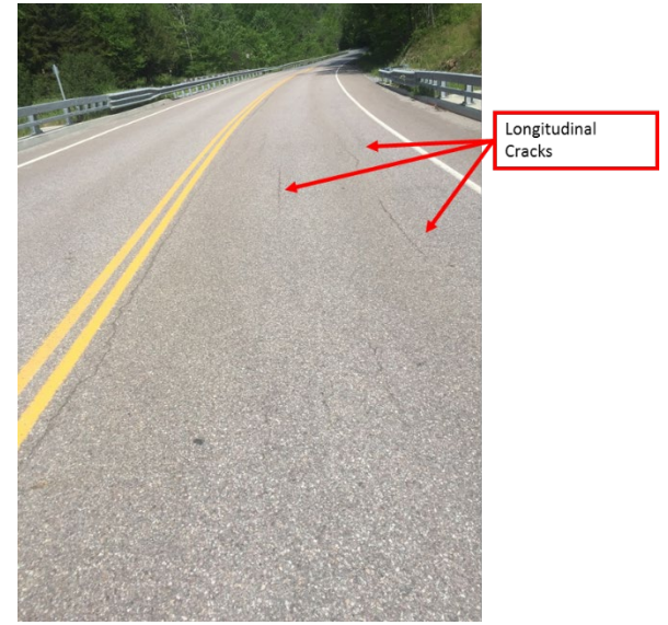
Figure 9: Longitudinal crack on northbound lane (June 2, 2016)