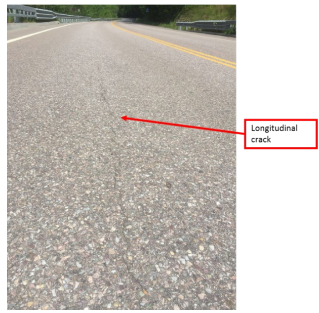
Figure 8: Longitudinal crack on southbound lane (June 2, 2016)