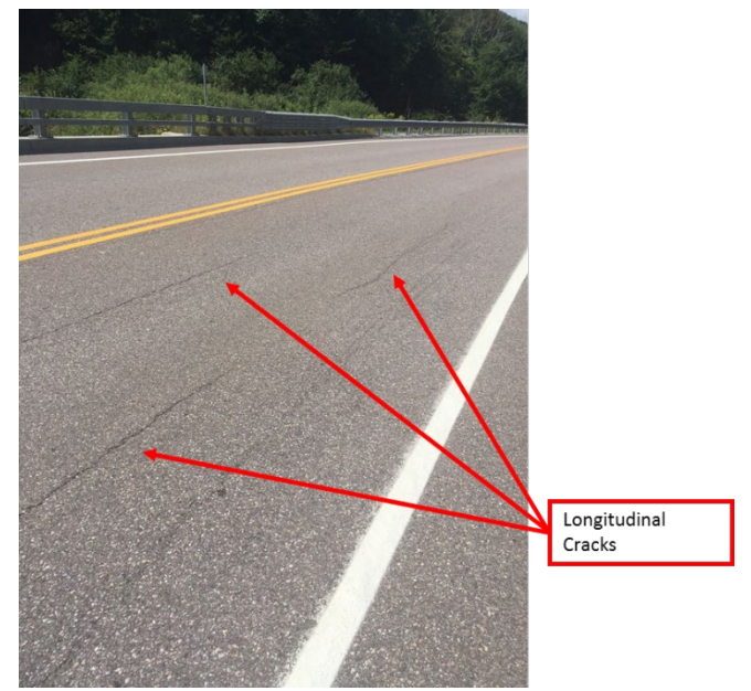
Figure 17: Longitudinal crack on northbound lane (August 15, 2017)