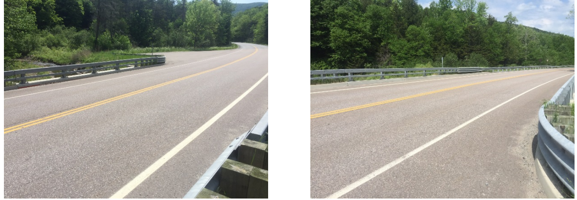
Figure 6: Overall view of bridge overlay (June 2, 2016)