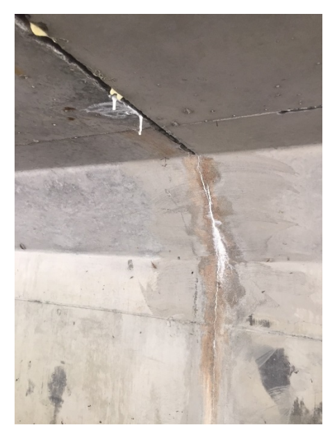
Figure 11: Bridge underside deposits (June 2, 2016)