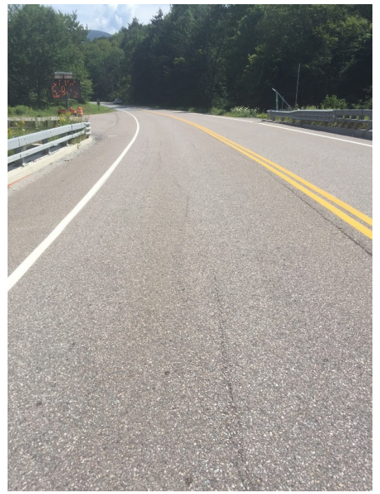
Figure 15: View of bridge overlay, looking south (August 15, 2017)