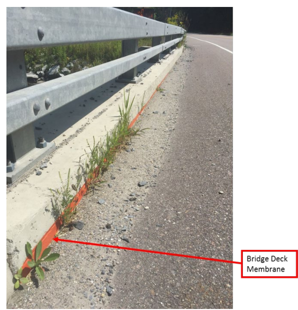
Figure 18: Bridge deck membrane (August 15,2017)