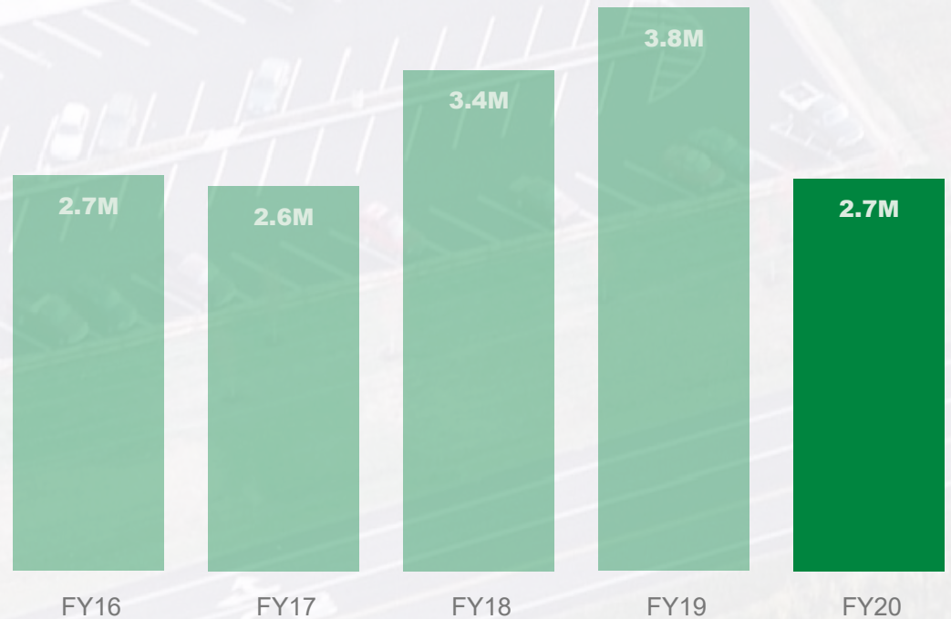
Spending by Fiscal Year ($, Millions)