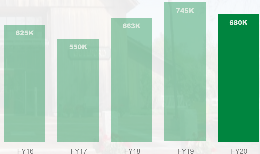
Spending by Fiscal Year ($, Millions)