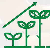
Spending by Fiscal Year ($, Millions)