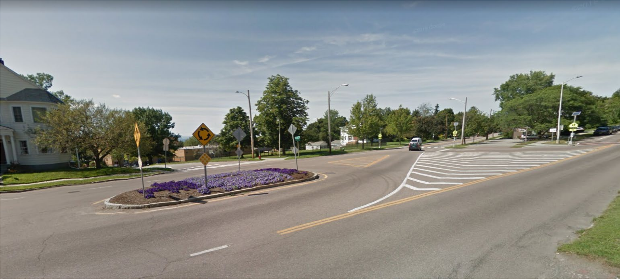
Shelburne Street Roundabout Project

Shelburne St. Roundabout BURLINGTON, VT.